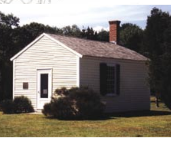
🔹 Working Blacksmith Shop