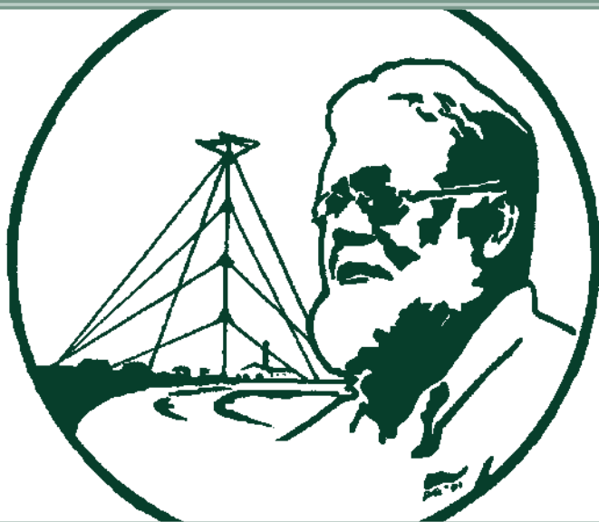
Reginald Fessenden and Radio Tower

On Christmas Eve 1906, Reginald Aubrey Fessenden made the first audio radio broadcast in history. Telegraph operators on ships in the Atlantic Ocean were shocked to hear a human voice emitting from the equipment they used to receive Morse code. Many operators called their captains to the radio room, where they heard Fessenden make a short speech, play a record, and perform a rendition of "O Holy Night" on his violin.