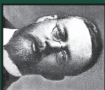
Reginald Fessenden c. 1906

Receive $1 off adult admission with your WCBH MemberCard.